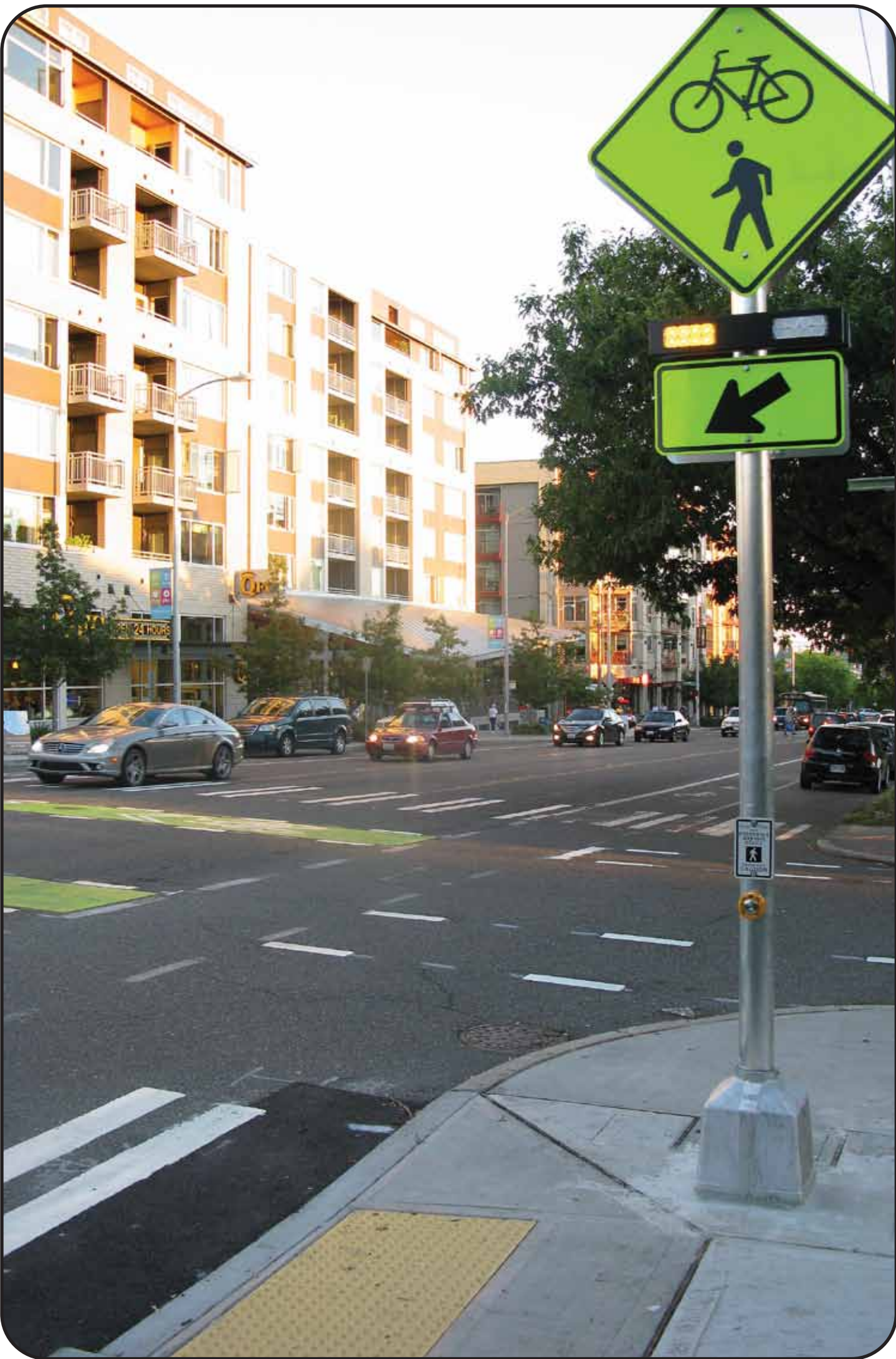
Rapid Flashing Beacon and Curb Ramp