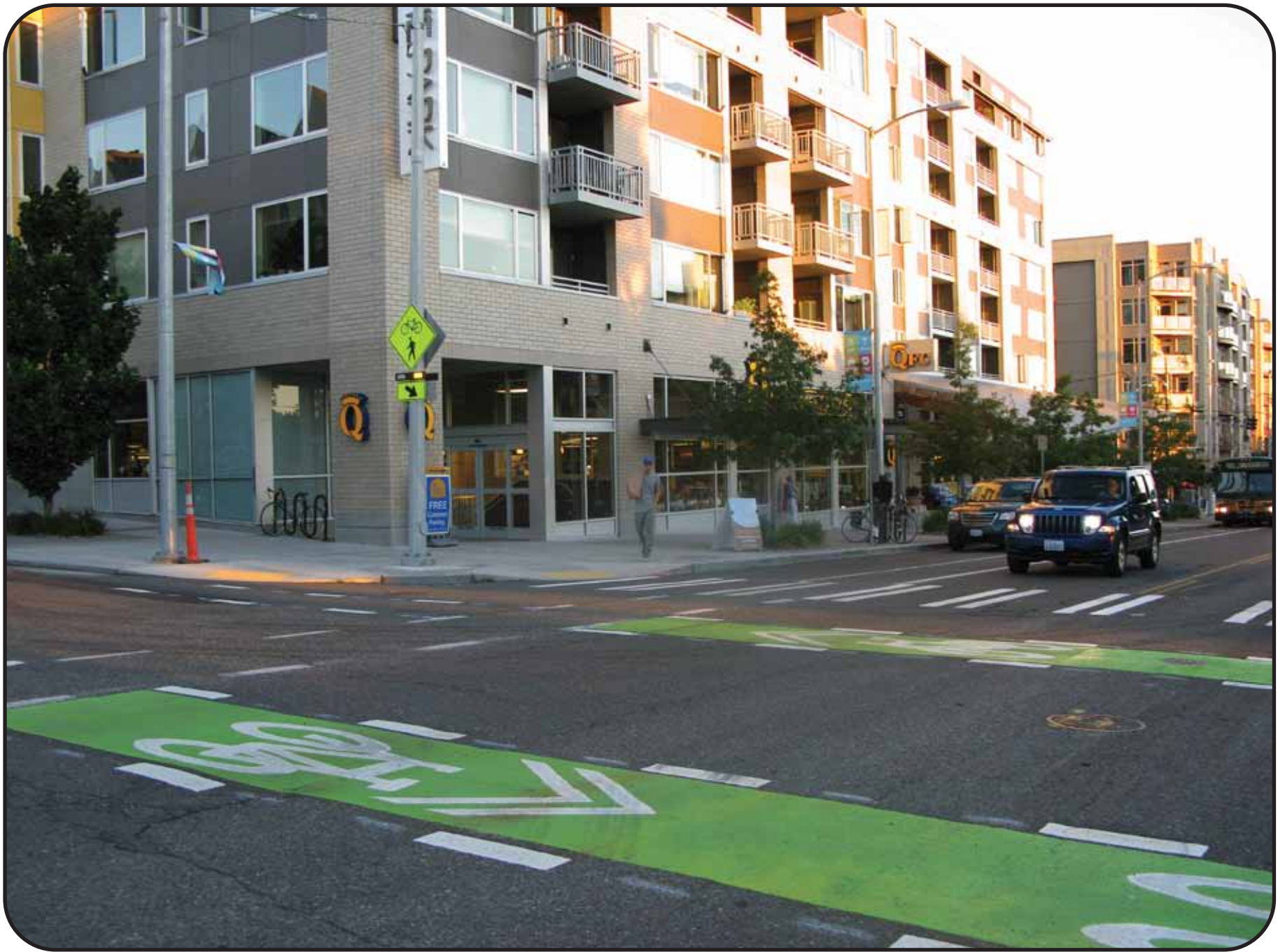
Curb Ramps, Crosswalk and Crossbike