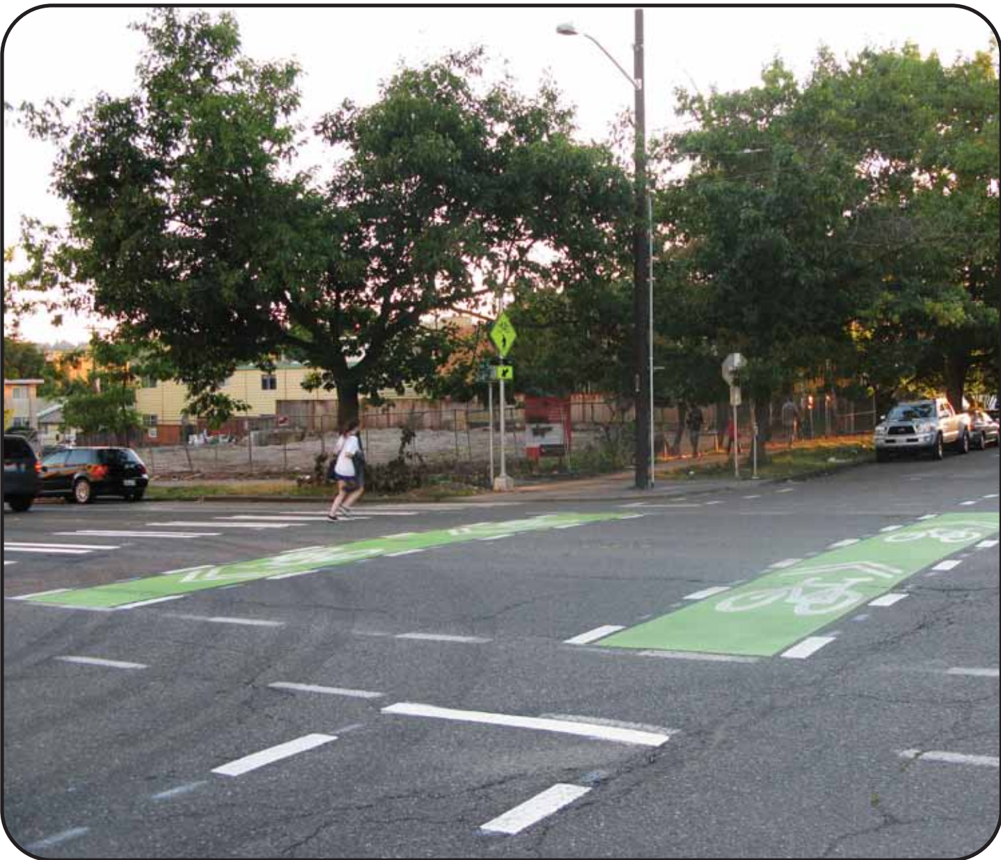
Crosswalk and Crossbike